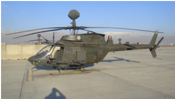
"For God, For Country, For Blue Max"

*Phone is for emergency use, but it does not constitute official information transmission. Please be advised the Red Cross remains the primary means of relaying official information. Do not hesitate to call for emergency situations.