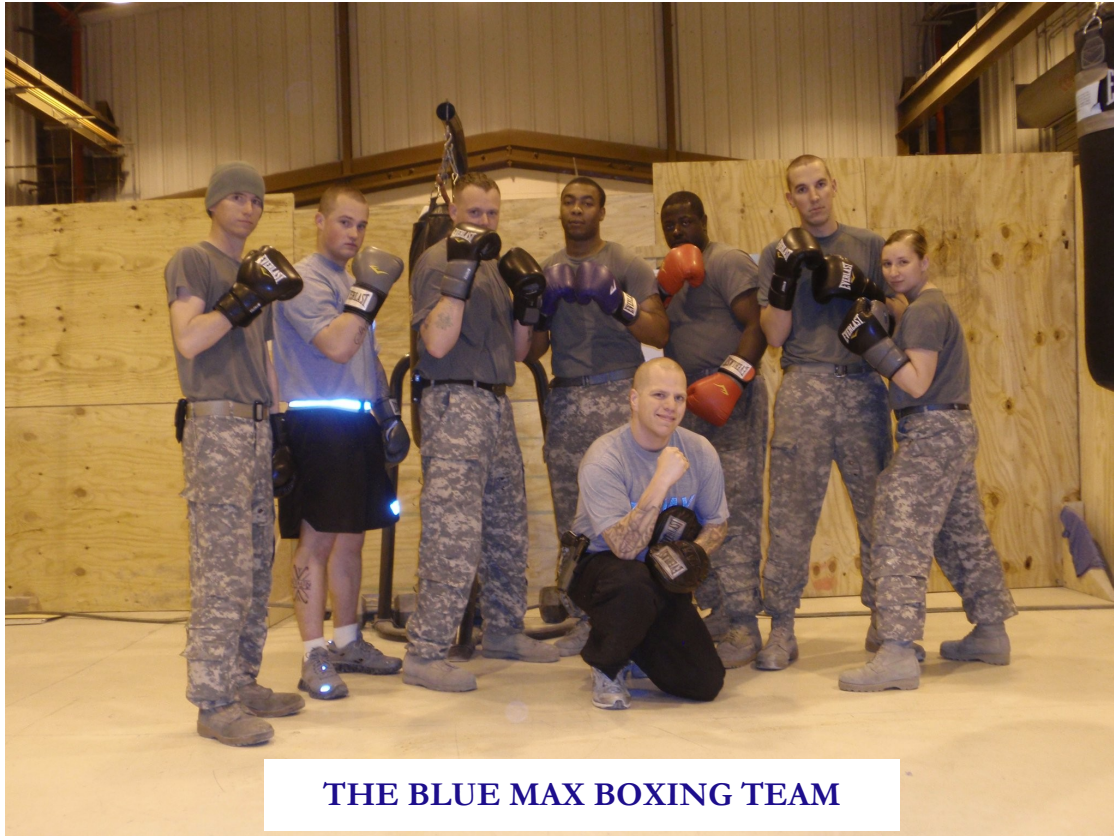
THE BLUE MAX BOXING TEAM